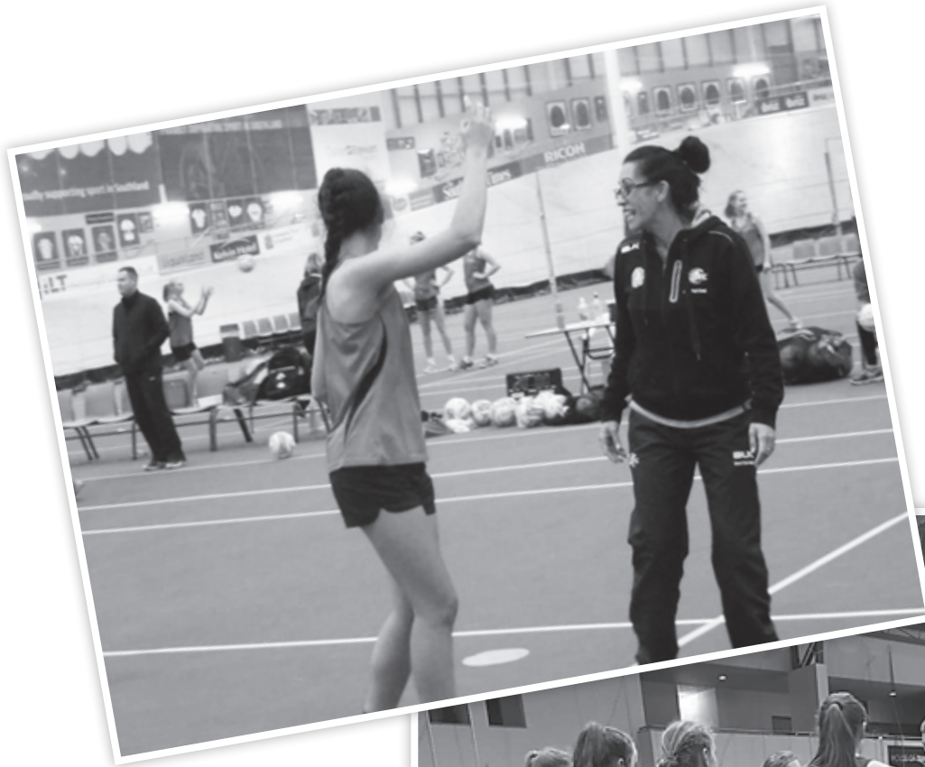
Performance Programme athletes in action during 2016