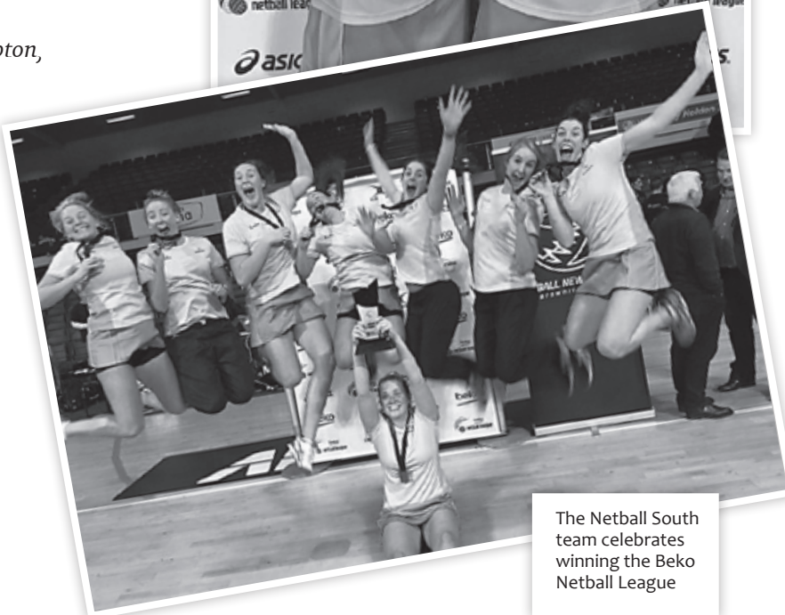
The Netball South team celebrates winning the Beko Netball League