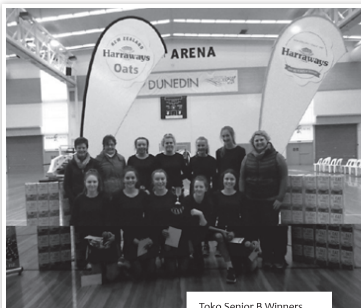
Toko Senior B Winners

During 2016, the Secondary School League was only played amongst the Southland schools due to logistical constraints in the other areas. All games were played on a home and away basis so all indoor venues could be utilised. In A grade, the teams were split into A and B sections dependent on what grade they were entered in for SISS.