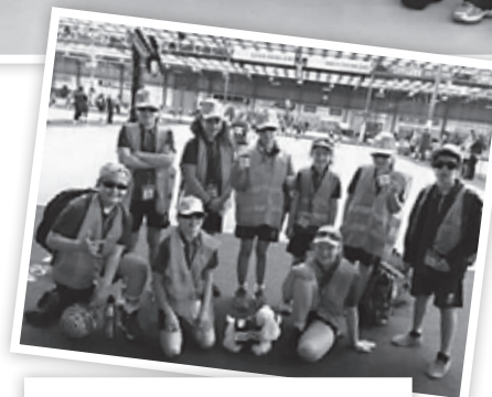
St Bernie's as Rio Security Guards