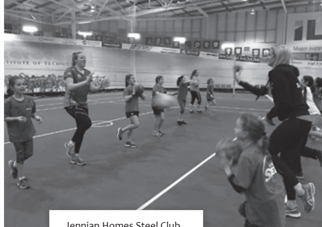
Jennian Homes Steel Club

555 participants registered for the programme during 2016. Not only does it prove beneficial for players to fine tune their fundamental skills, they also gain a better understanding of the game. When the Steel players visited, participants got to understand what it is like to be an elite netballer - which many of them are striving to be. Coaches also thrive in this environment as they learn new strategies and try different games and activities.