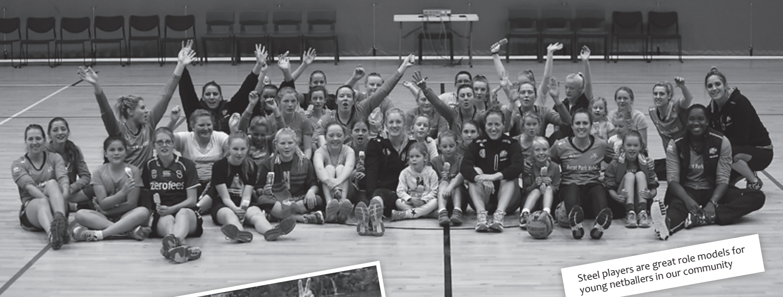
The Netball South Team