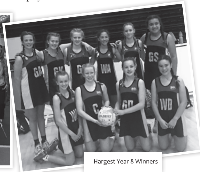
Hargest Year 8 Winners